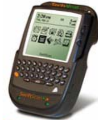
SwiftScan BARCODE SCANNER